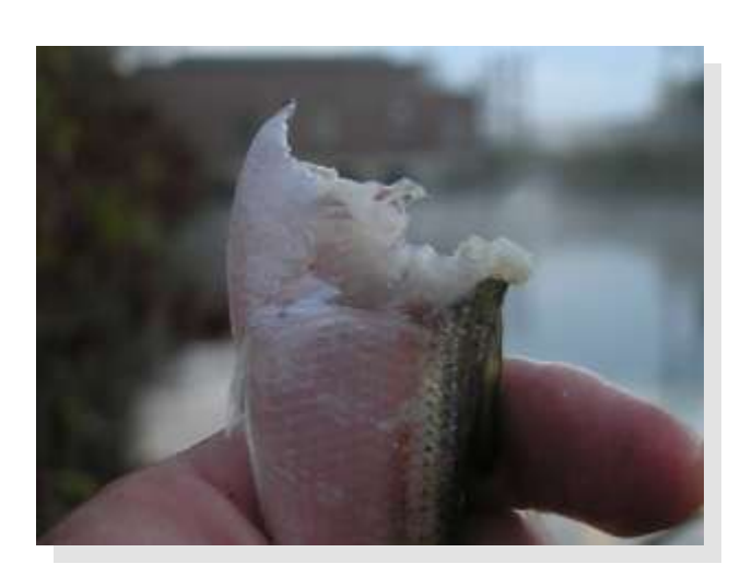
Billion dollar dam owner vs. migratory fish

Complaints filed in the cases cite findings by the National Marine Fisheries Service (NMFS) and U.S. Fish and Wildlife Service that dams "are among the leading causes of both historical declines and contemporary low abundance" of Kennebec and Androscoggin salmon, and that "dams remain a direct and significant threat to Atlantic salmon." We also allege owners and operators of Weston and Shawmut dams, Lockwood dam, and Hydro Kennebec dam are violating specific language of their "water quality certifications" issued by the State of Maine (incorporated verbatim into their federal licenses) under the Clean Water Act, by allowing downstream-migrating adult salmon and adult shad to pass through dam turbines without first conducting studies to prove such passage is safe.